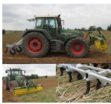
Roller crimper UB - Spain

Furthermore, the no tillage system may reduce the risk of nutrient Roller crimper UG, ILVO, INAGRO losses from the soil/plant system and greenhouse gas soil emissions, thus having benefits for the whole society.