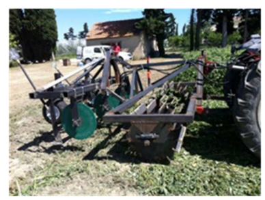
Roller crimper GRAB - France