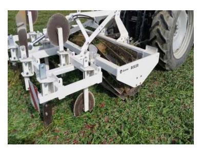
Roller Crimper UM - Slovenia