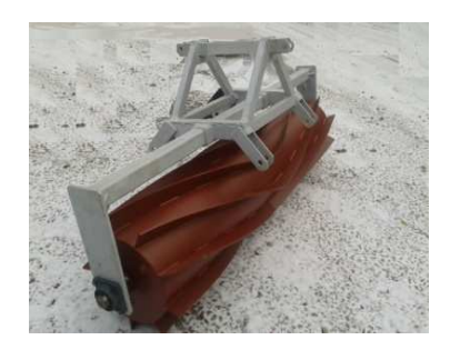
Roller crimper AREI - Latvia

However, the introduction of no tillage techniques is very challenging and often reduces yield and quality, especially in Northern European countries, where soil and climate conditions may limit the implementation of this approach.