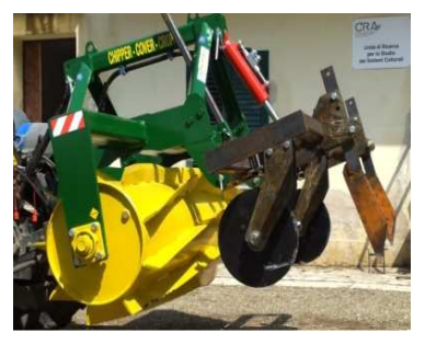
Roller Crimper CREA - Italy

Larger horizontal roots or deeper roots were generally observed in the tilled variants;