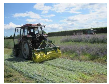
Roller Crimper AU Food - Denmark